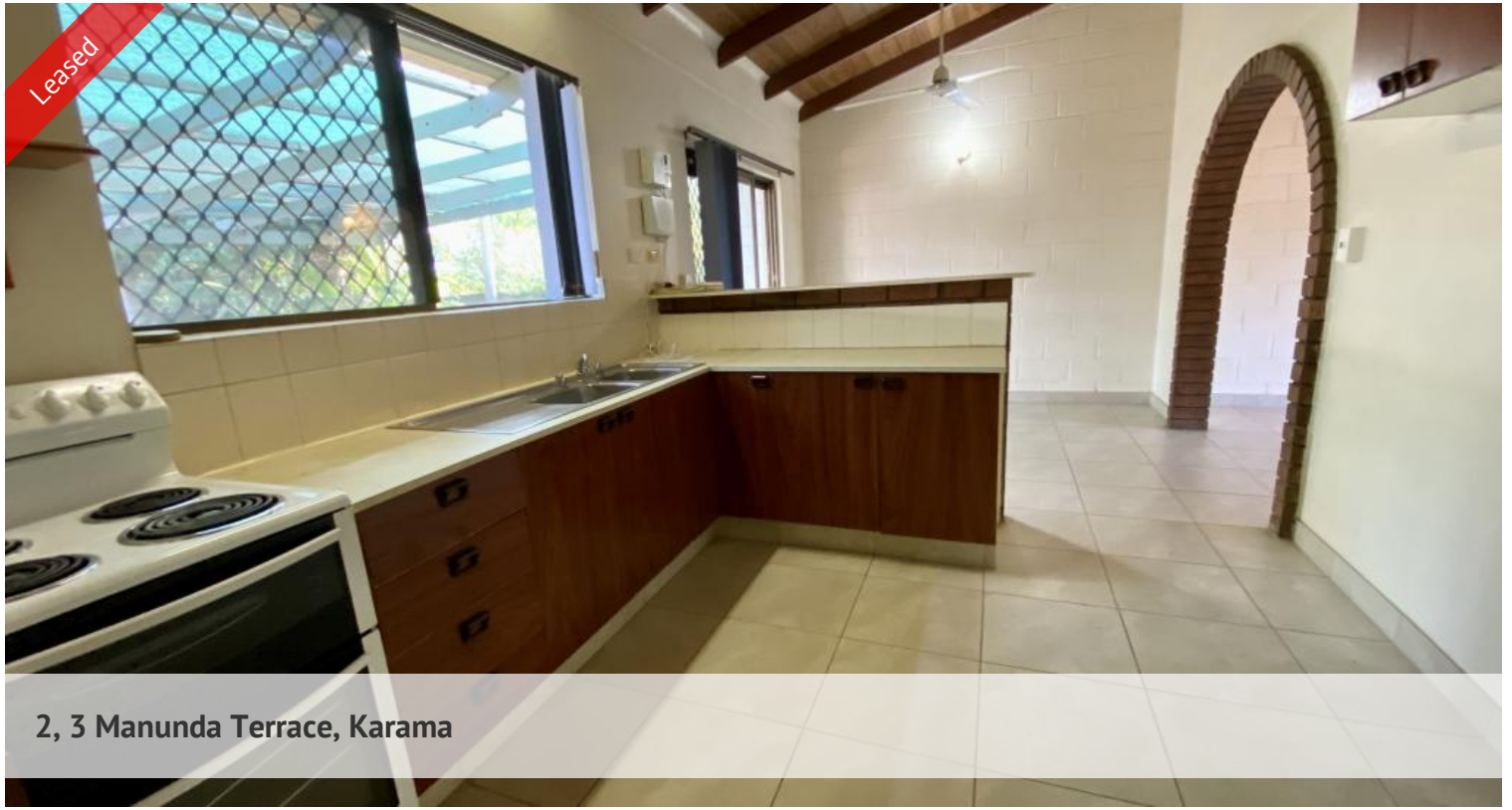
2, 3 Manunda Terrace, Karama