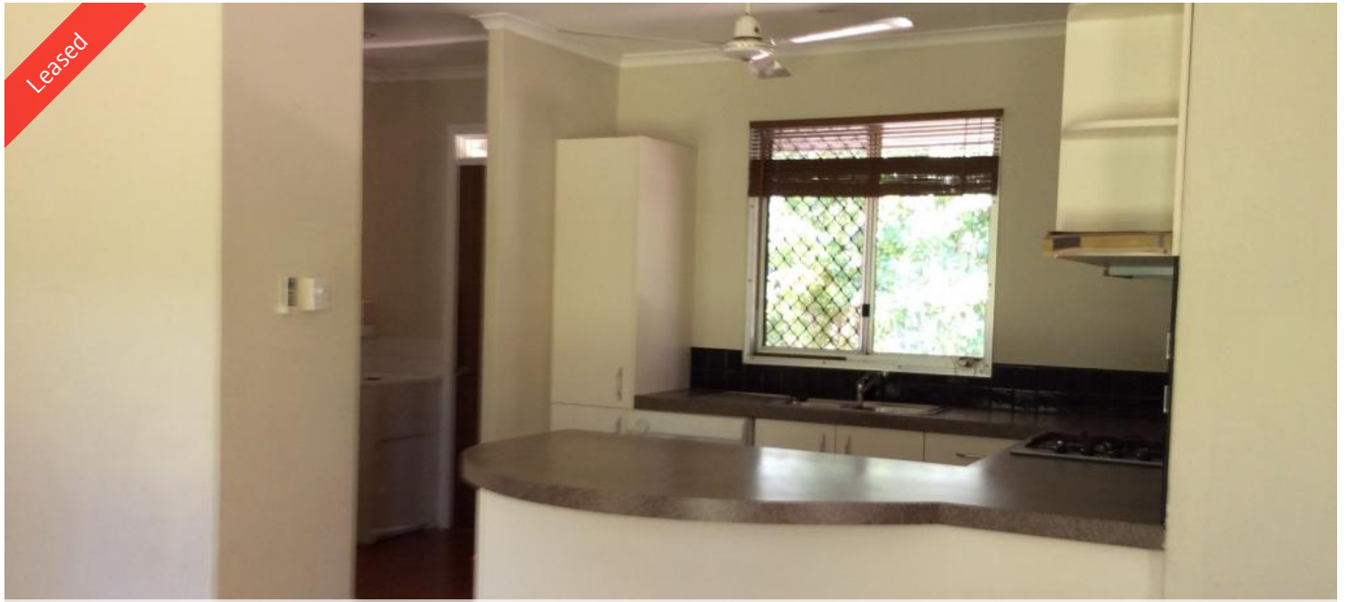
2 Nandina Ct, Leanyer