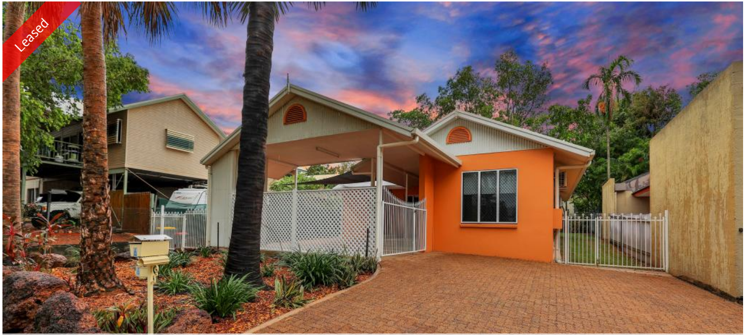
6 Emily Ct, Driver