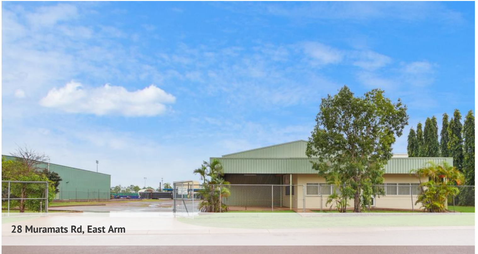
28 Muramats Rd, East Arm