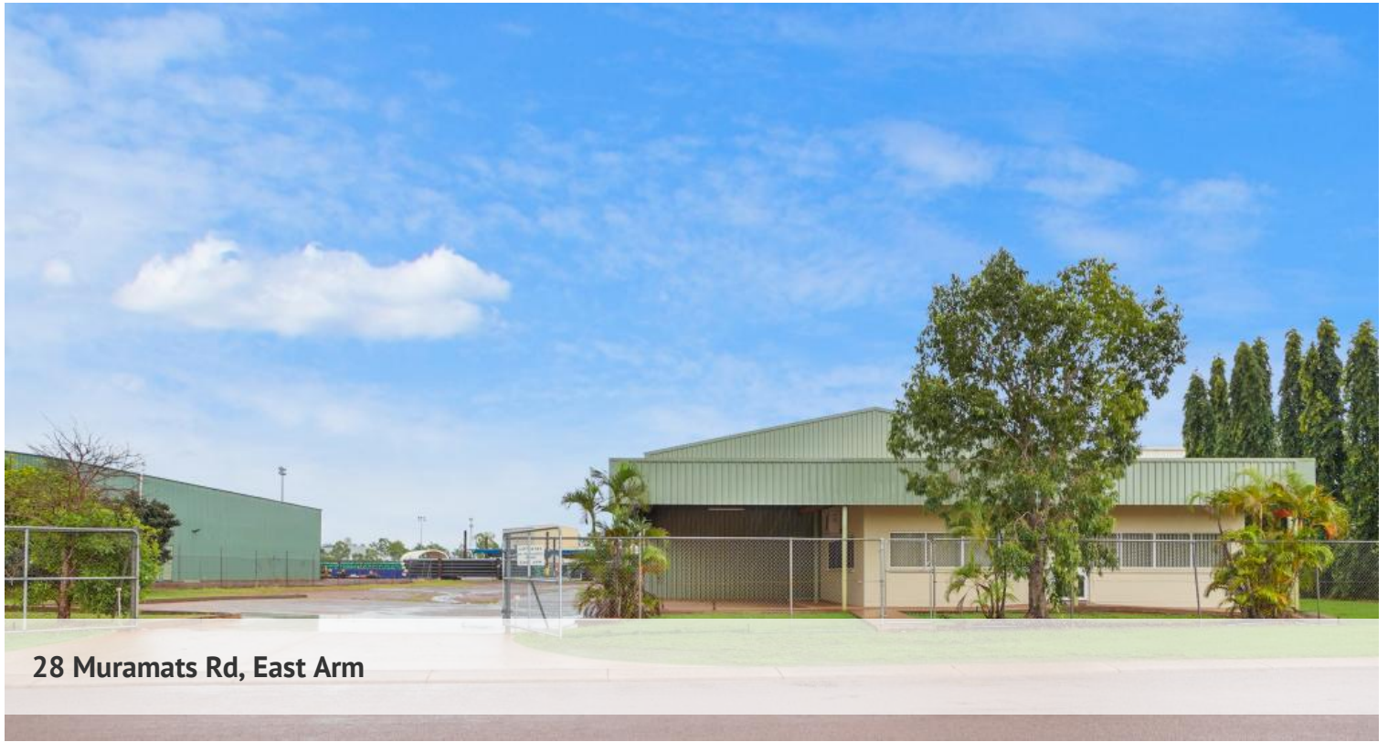
28 Muramats Rd, East Arm