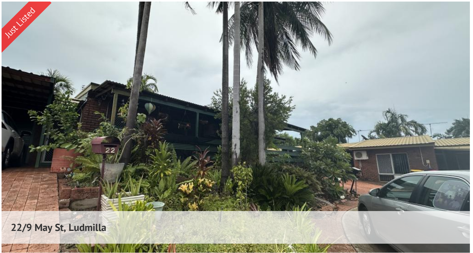
22/9 May St, Ludmilla