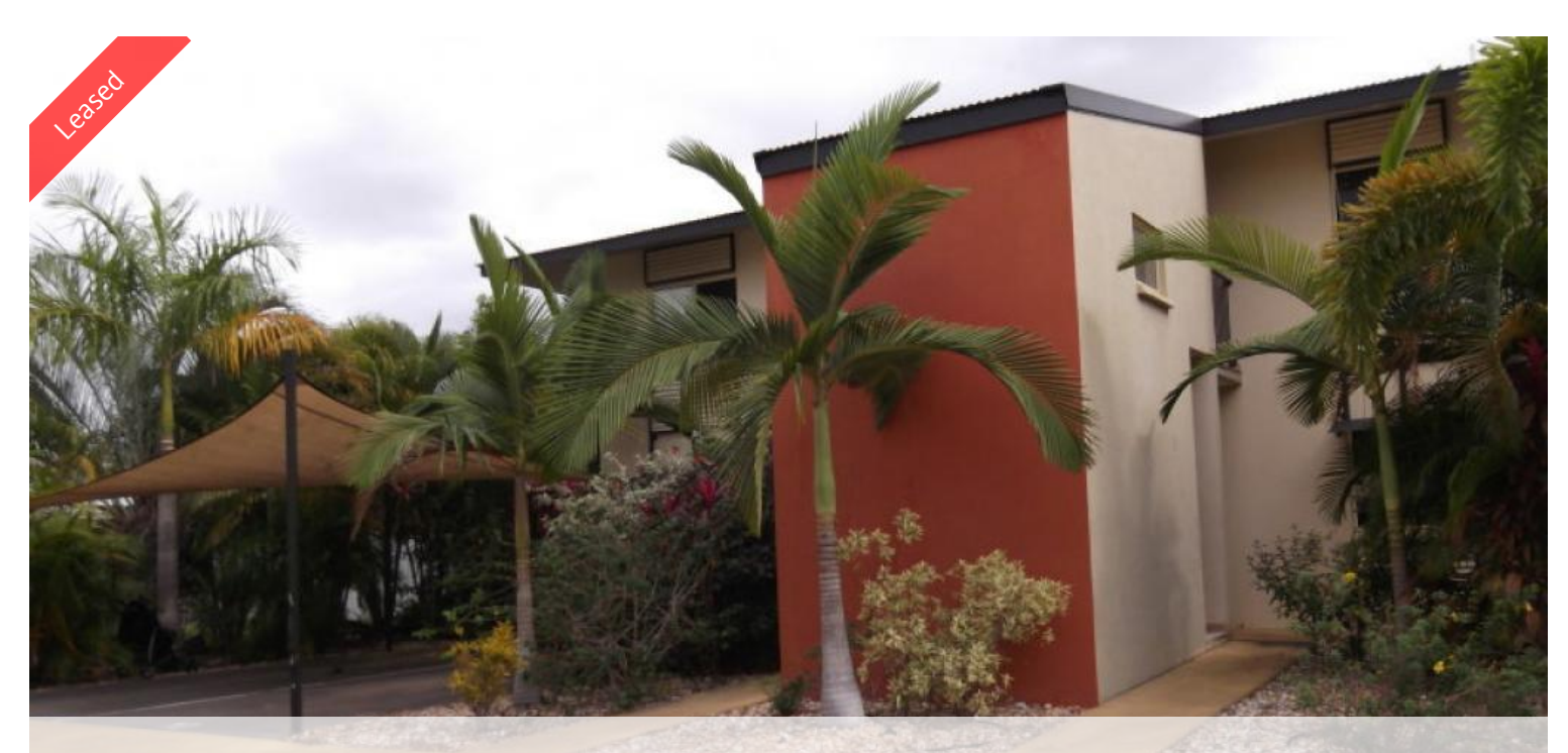
Unit 10, 11 Negri Street, Bakewell