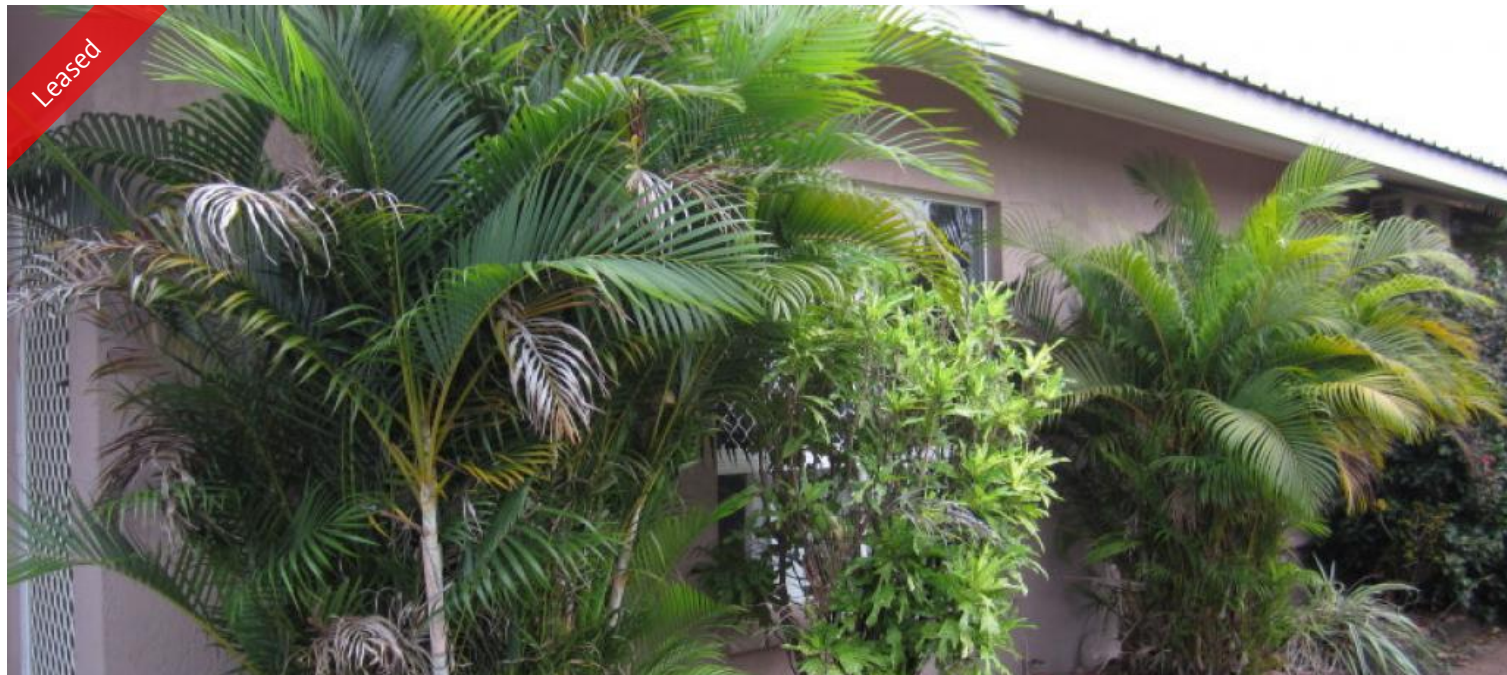
Unit, 80 Forrest Parade, Bakewell