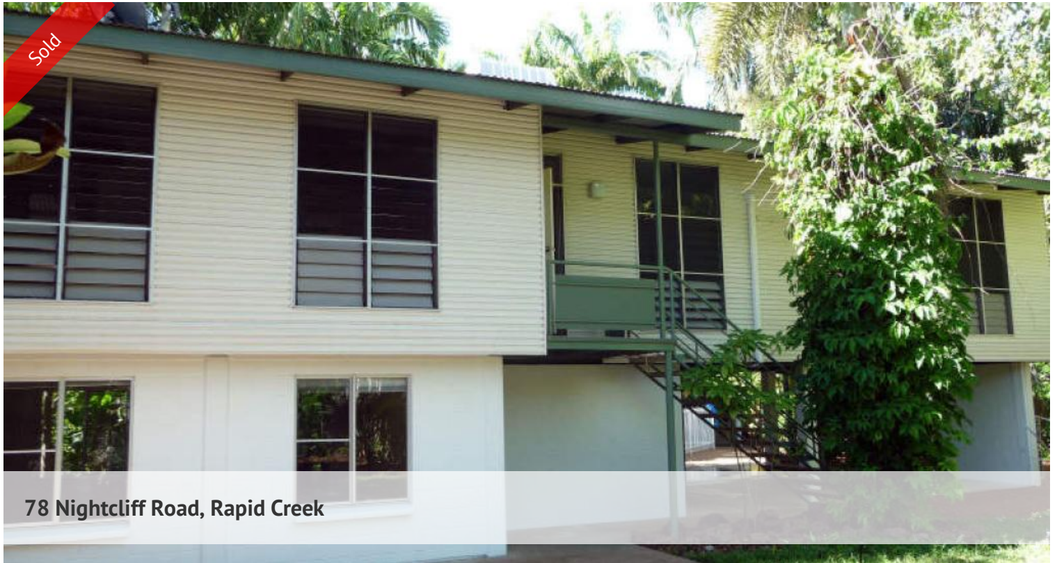
78 Nightcliff Road, Rapid Creek