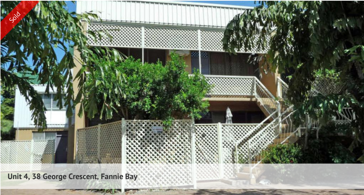
Unit 4, 38 George Crescent, Fannie Bay