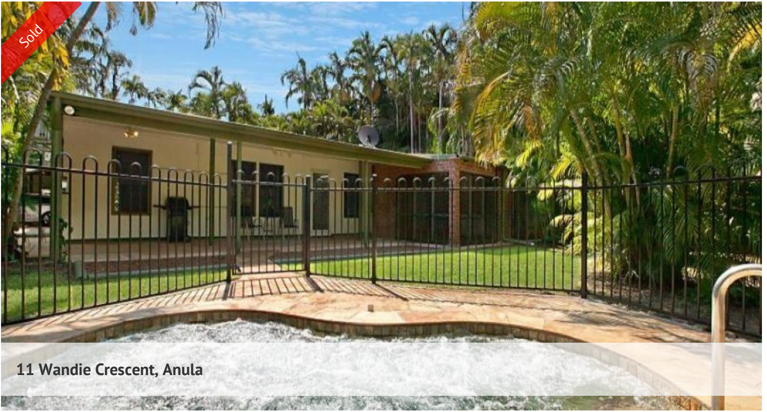
11 Wandie Crescent, Anula