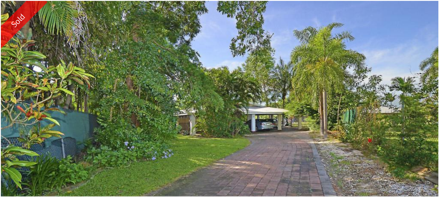
21 Callie Court, Rosebery