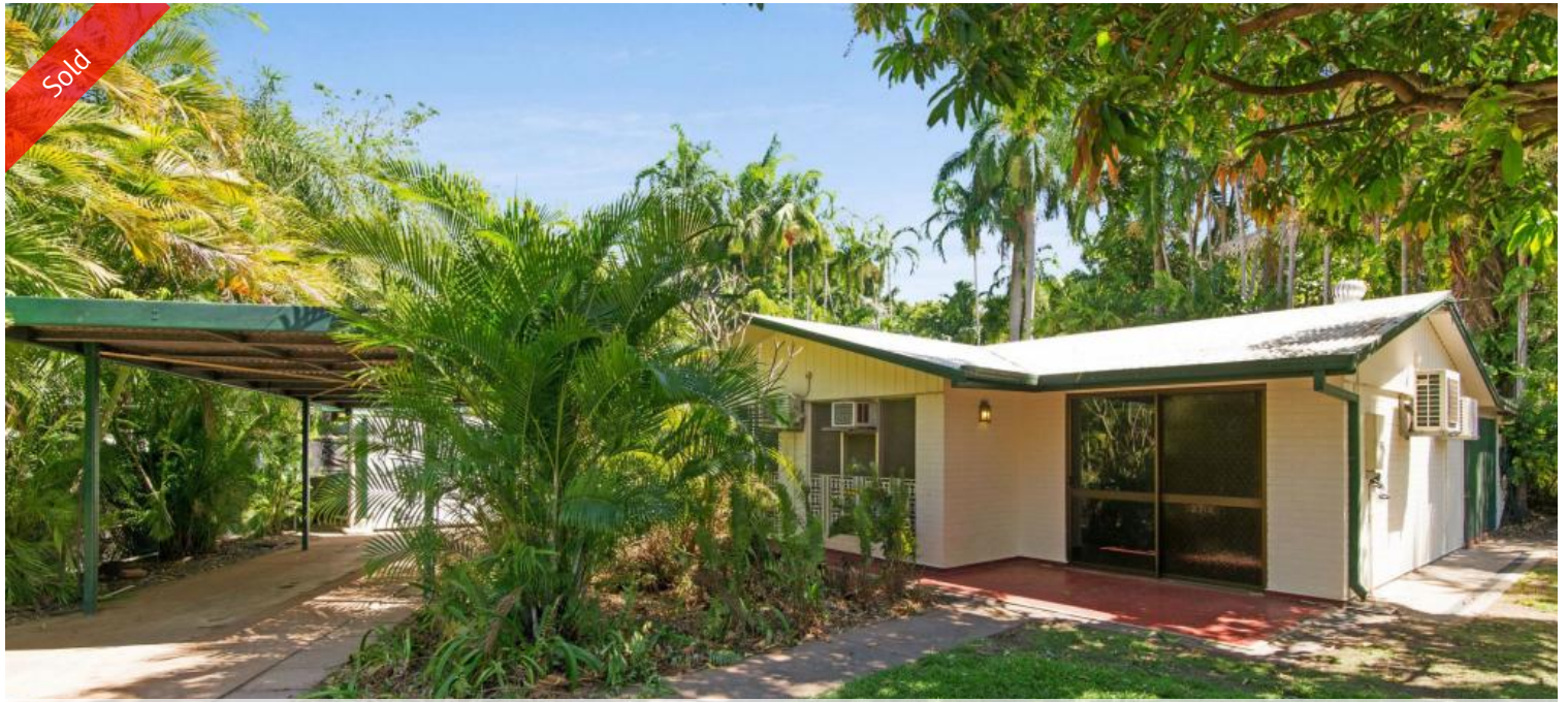
38 Harney Street, Ludmilla