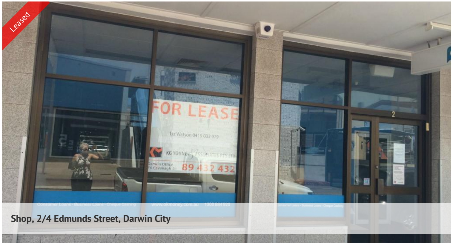
Shop, 2/4 Edmunds Street, Darwin City