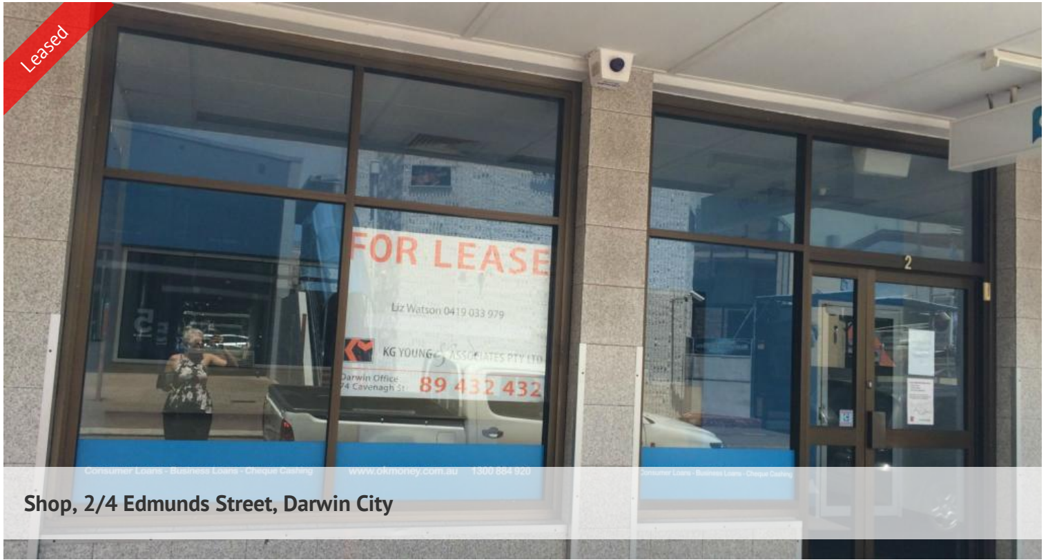
Shop, 2/4 Edmunds Street, Darwin City